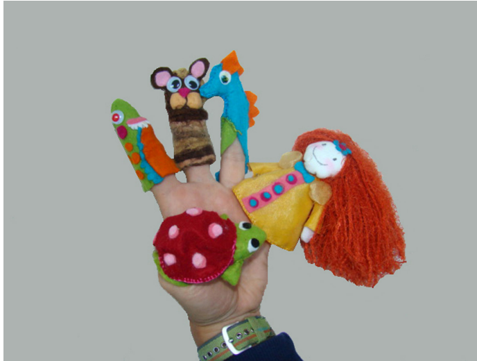
Figure 10. Puppet , 2009. Antonio Cruz. Faculty of Education. University of Cadiz.