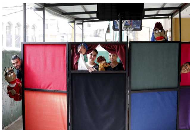
Figure 3. An actor from a theatre puppet show performs at an UNERWA school in Beirut. May, 2015.