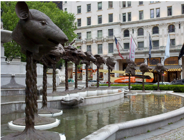
Figure 1. Circle of Animals/Zodiac Heads , 2011. Pulitzer Fountain, New York. Copyright Ai Weiwei. Courtesy of the artist.

The newspaper El País published an article in its arts section about an installation by the artist and activist. The material used to create this piece was sourced from hundreds of lifejackets worn by refugees and immigrants while crossing the sea from Turkey to Greece, attached to the columns of the Berlin Konzerthaus . The idea of this piece was to raise awareness of the refugee crisis.