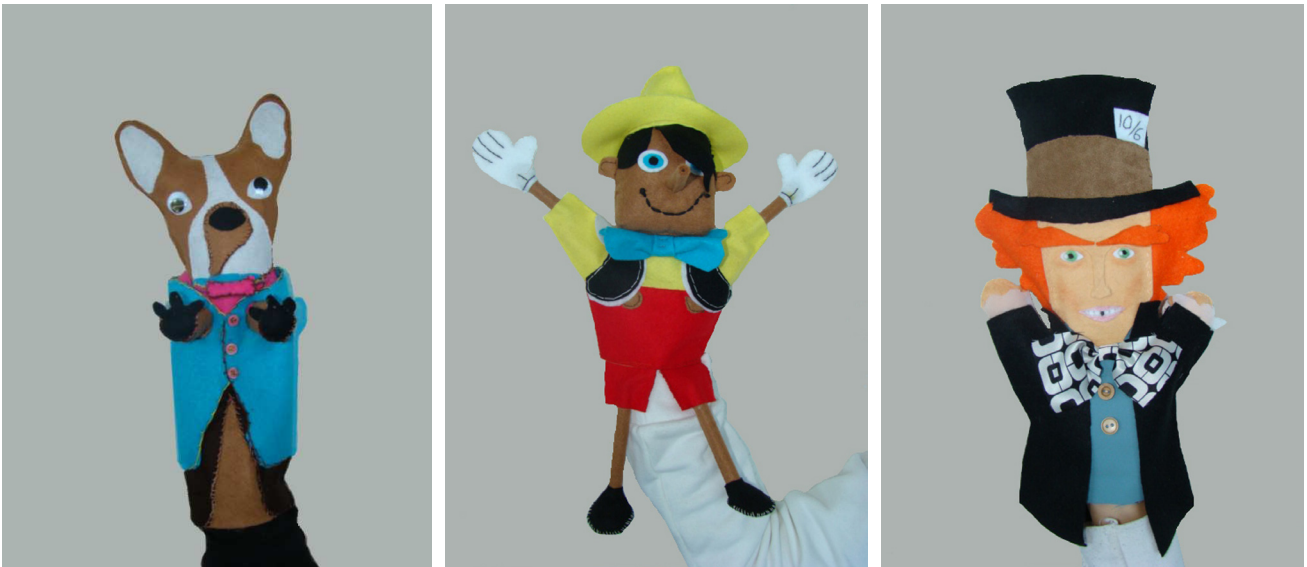
Figure 7. Puppet , 2009. María Gloria Corrales.