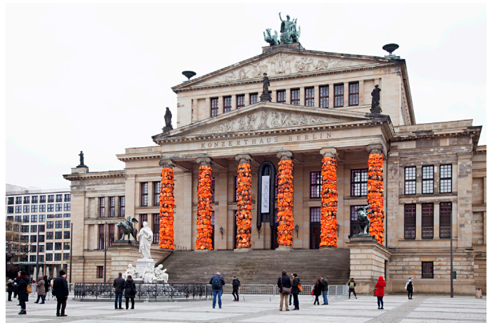
Figure 2. Safe Passage , 2016. Konzerthaus Berlin. Copyright Ai Weiwei. Courtesy of the artist.